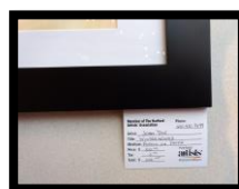
Front of Frame