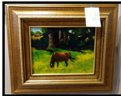
Information Card draped in front