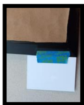
Back of Frame

Artist Name / Title / Medium / Phone Number / Price / Tax / Total