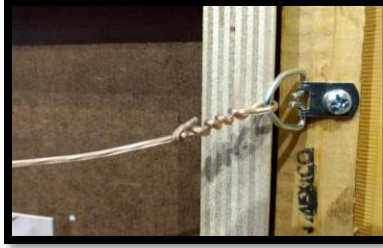
Hanging wire attached to the frame with D ring

DO NOT ATTACH WIRE TO THE ARTWORK SAW-TOOTH HANGERS ARE NOT ACCEPTABLE