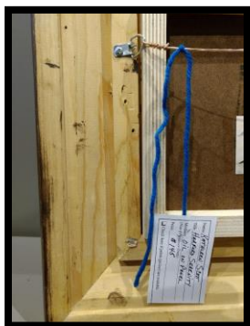
Attaching Information Card to wire