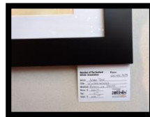
Front of Frame