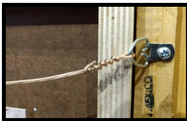
Hanging wire attached to the frame with D ring

DO NOT ATTACH WIRE TO THE ARTWORK SAW-TOOTH HANGERS ARE NOT ACCEPTABLE