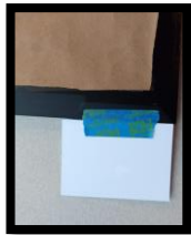
Back of Frame

Artist Name / Title / Medium / Phone Number / Price / Tax / Total