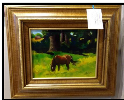
Information Card draped in front